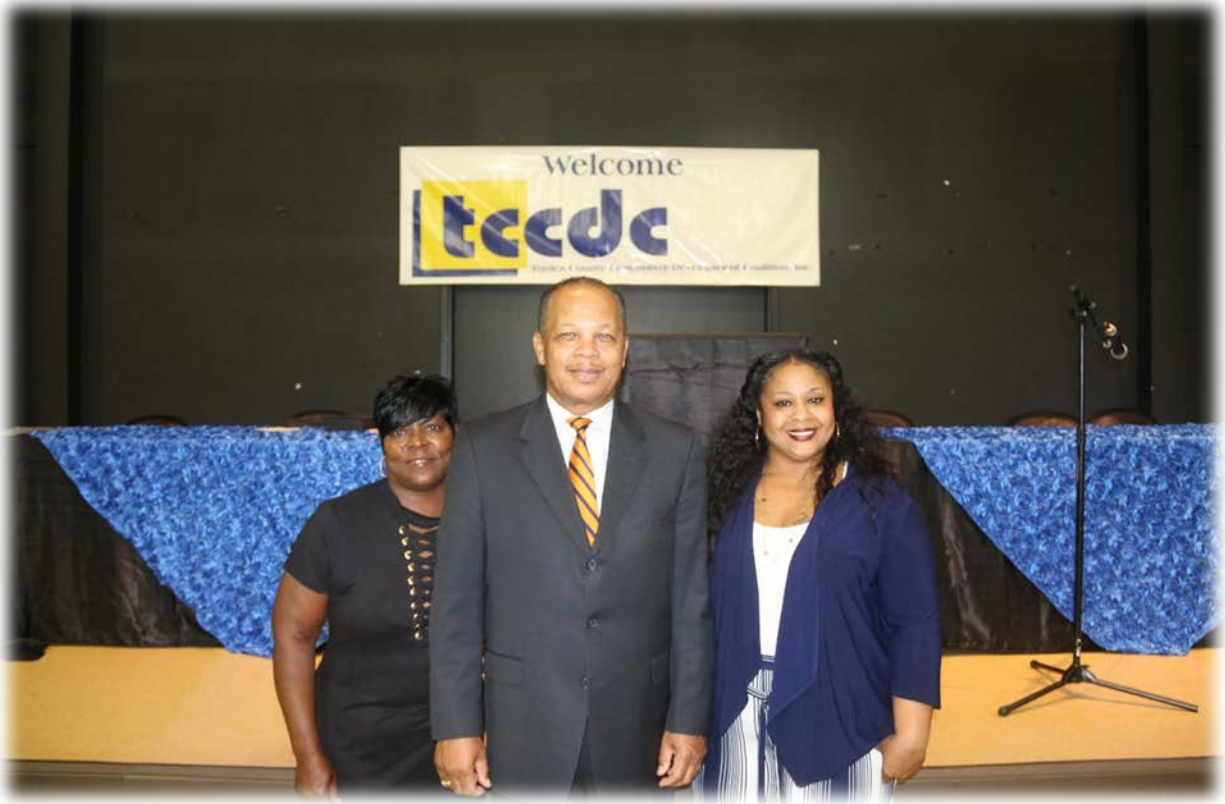
Tunica County CDC Staff